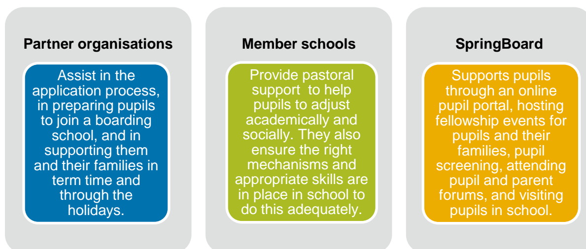
Figure 1: Tripartite support provided to SpringBoard pupils

SpringBoard is also soon to launch a parent portal, alongside the pupil portal, the aim of which is to provide additional support to SpringBoard pupils' parents.