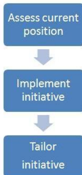
Diagram 2 Phases of school improvement journey

In effective systems, the middle tier contributes to continuous improvement by taking schools through successive stages in the 'improvement journey'. For example, Mourshed et al. (2010) identified the need to support schools at three key stages on this journey: