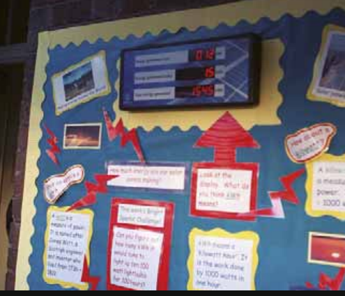
Woodheys Primary School