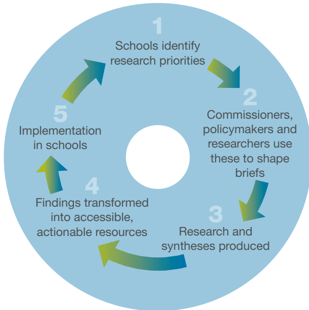
Figure 3 Evidence cycle

A school research directory enabling schools to register their interest in taking part in research addressing specific questions or themes. Having ready-made groups of schools willing to participate in specific research projects would enable more research to be undertaken on topics of interest to schools; it would also provide a mechanism for linking like-minded schools with a common interest in developing practice. Such a resource would be a natural evolution of NFER's existing Register of Schools used to support our own research projects.